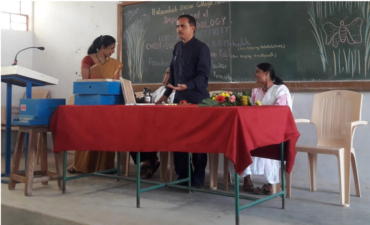
Demonstration Bee Keeping